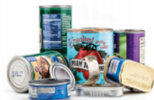
Food & Beverage Cans Latas de alimentos y bebidas