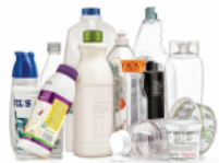
Plastic Bottles & Containers Botellas y envases de plástico