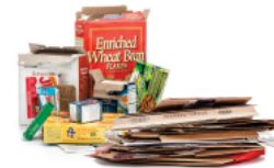
Flattened Cardboard & Paperboard Cartón y cartulina aplastados