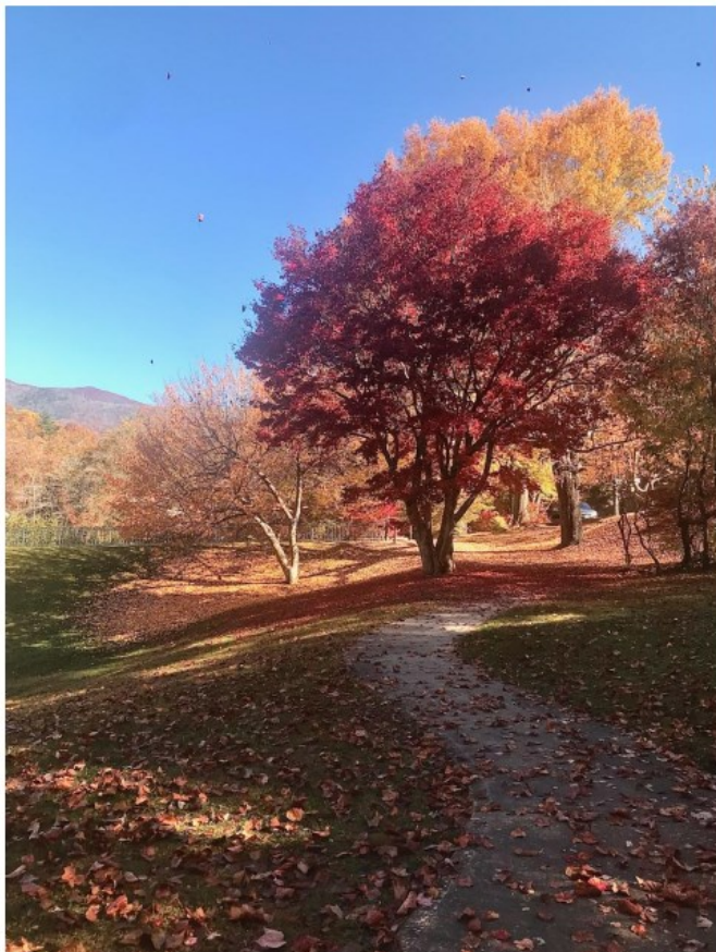
Pretty fall scene near Black Mountain, North Carolina